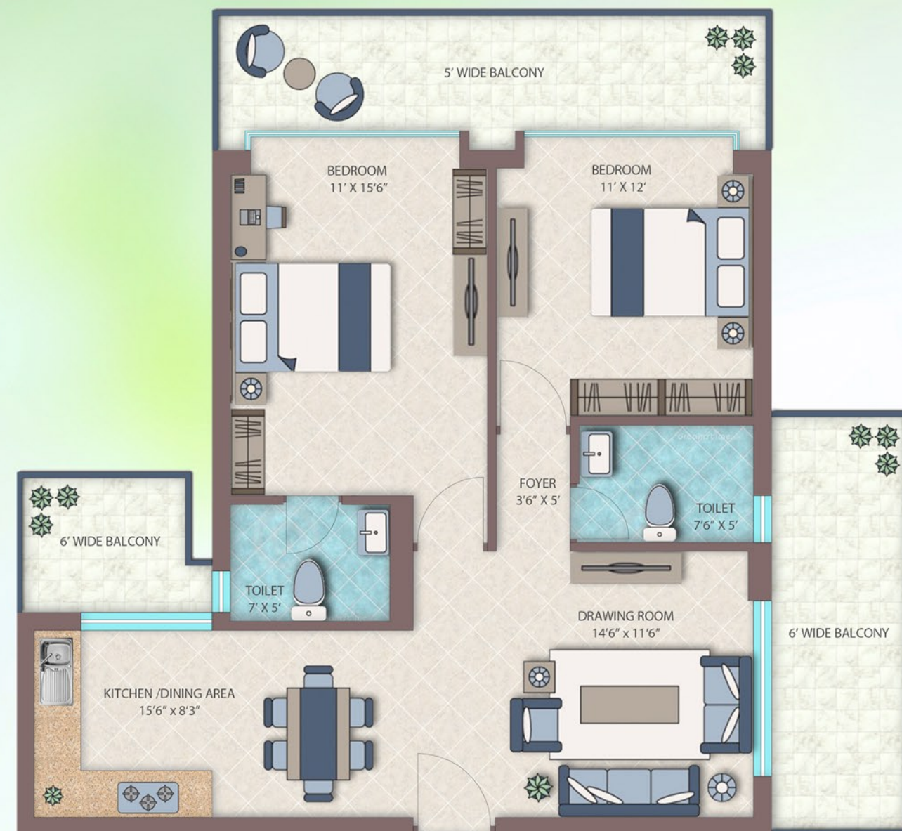
2BHK - 1310 SFT