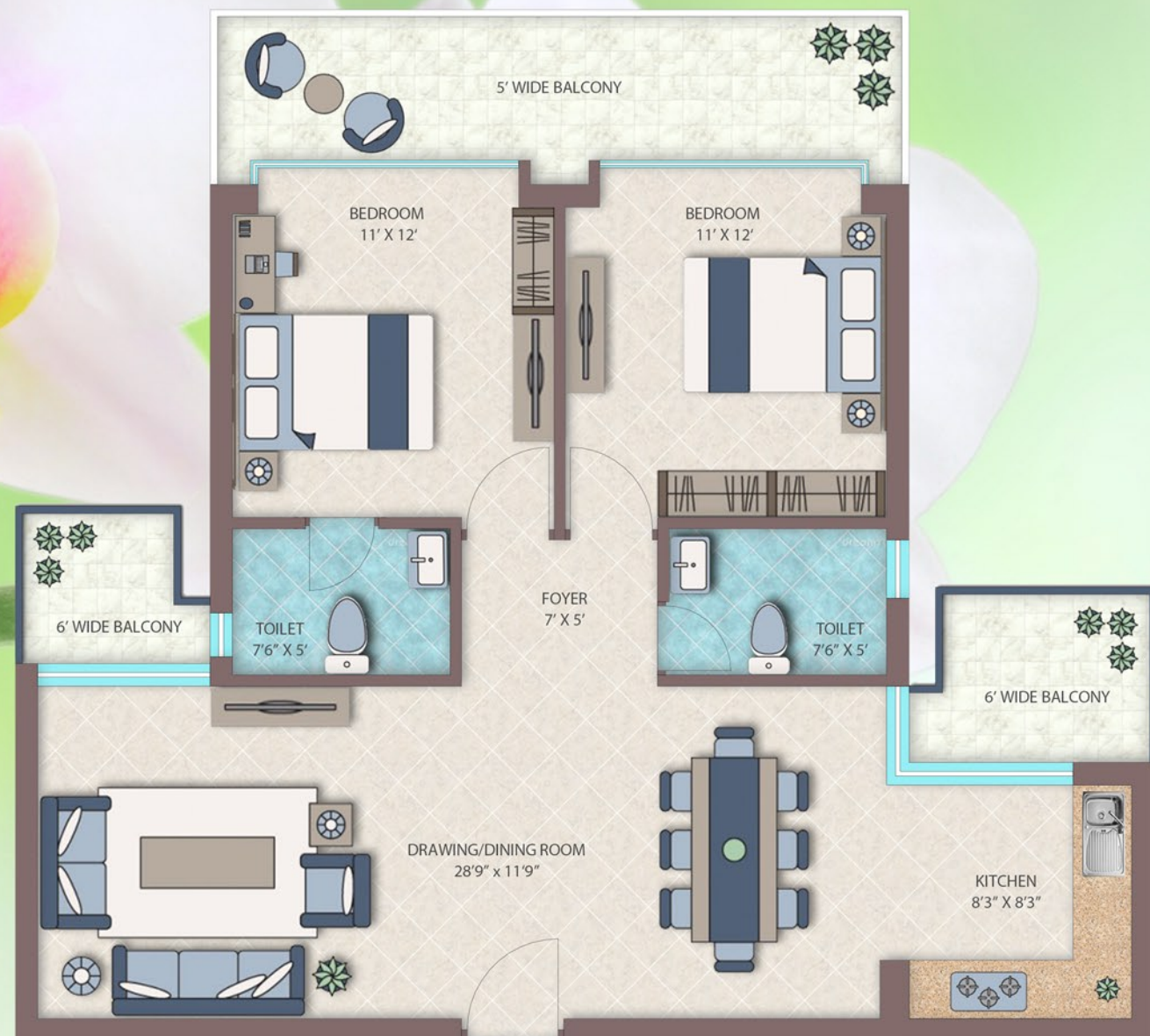
2BHK - 1260 SFT